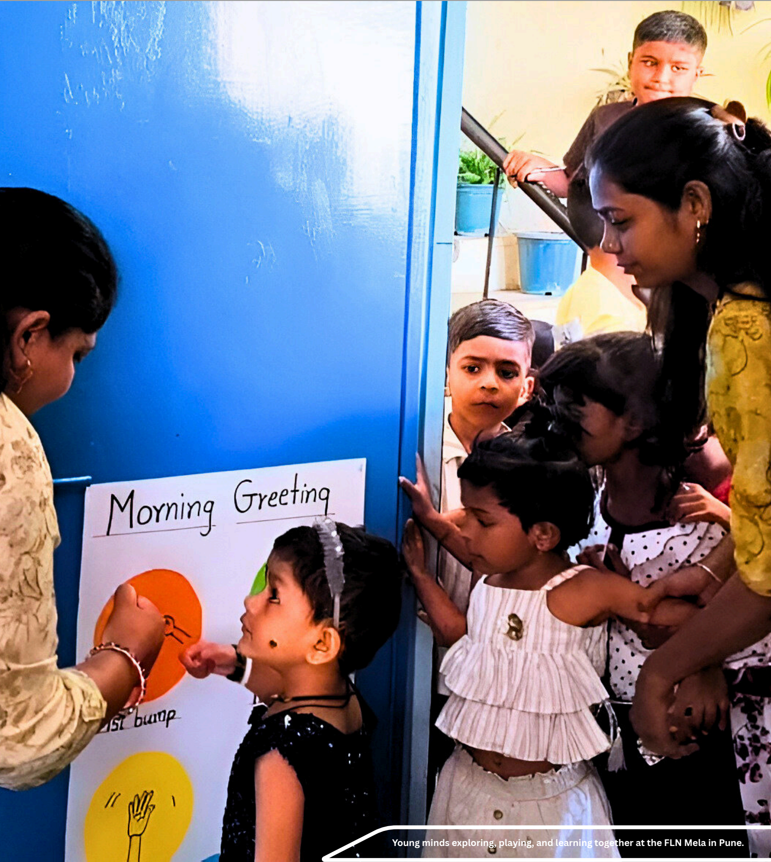
Young minds exploring, playing, and learning together at the FLN Mela in Pune.